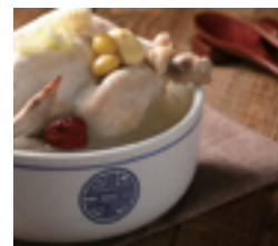
Samgye-tang Ginseng Chicken Soup