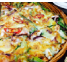
Haemul-Pajeon Seafood and Green Onion Pancakes