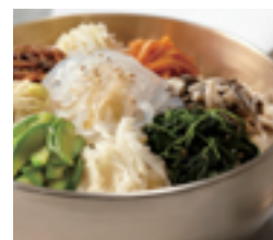
Bibimbap Mixed Rice with Mean and Assorted Vegetables