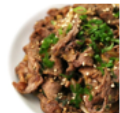
Bulgogi Marinated Meat Cooked on the Grill